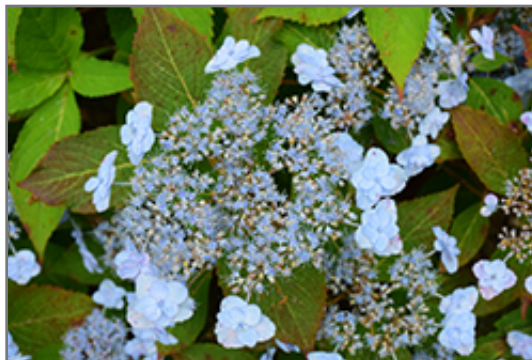
Tiny Tuff Stuff Hydrangea flowers