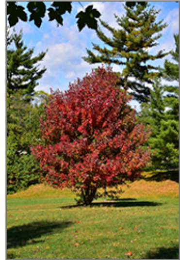
Redpointe Red Maple in fall

* This is a 'special order' plant - contact store for details