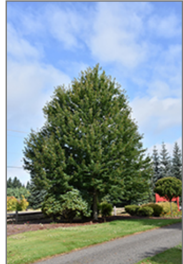
Redpointe Red Maple