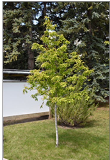
Amur Maple (tree form)