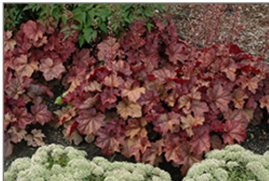
Lava Lamp Coral Bells

* This is a 'special order' plant - contact store for details