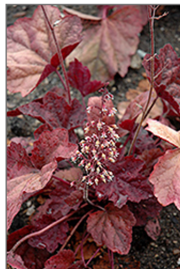
Lava Lamp Coral Bells flowers