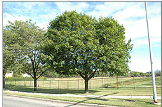
Norway Maple