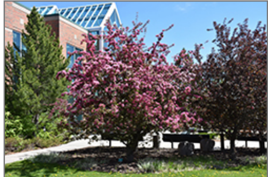
Makamik Flowering Crab in bloom