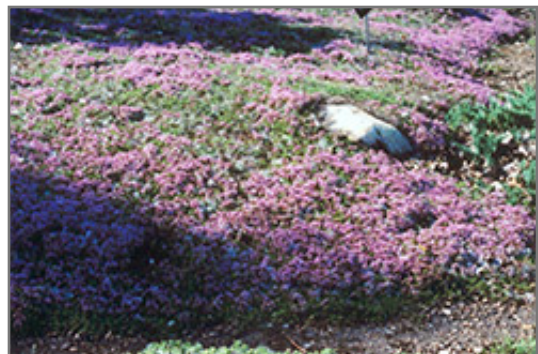
Mother-of-Thyme in bloom