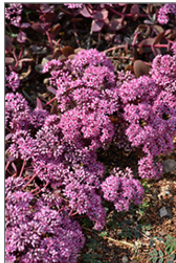
Cherry Tart Stonecrop flowers

* This is a 'special order' plant - contact store for details