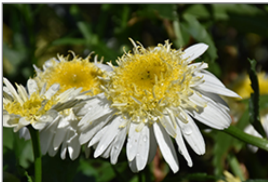
Realflo Real Glory Shasta Daisy flowers

Realflo Real Glory Shasta Daisy is recommended for the following landscape applications;