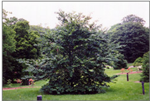
American Beech