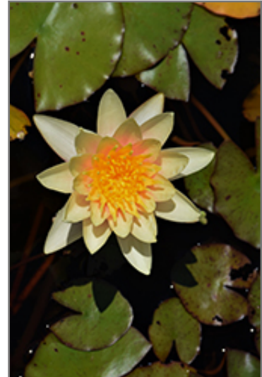
Comanche Hardy Water Lily flowers

Comanche Hardy Water Lily is ideally suited for growing in a pond, water garden or patio water container, and is recommended for the following landscape applications;