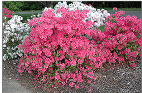
Rosy Lights Azalea in bloom