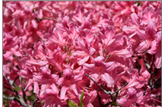
Rosy Lights Azalea flowers

Rosy Lights Azalea is recommended for the following landscape applications;