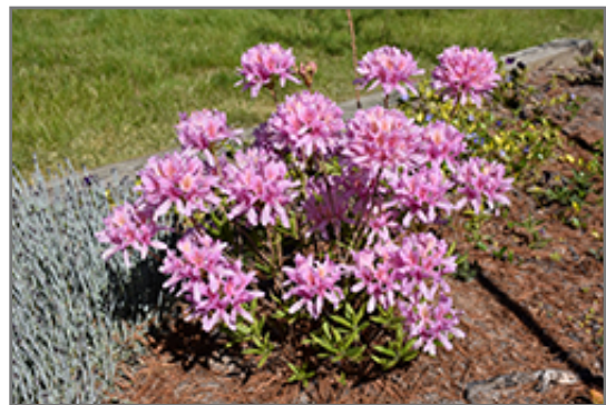
Orchid Lights Azalea in bloom