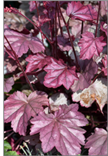
Stainless Steel Coral Bells foliage

Stainless Steel Coral Bells is recommended for the following landscape applications;