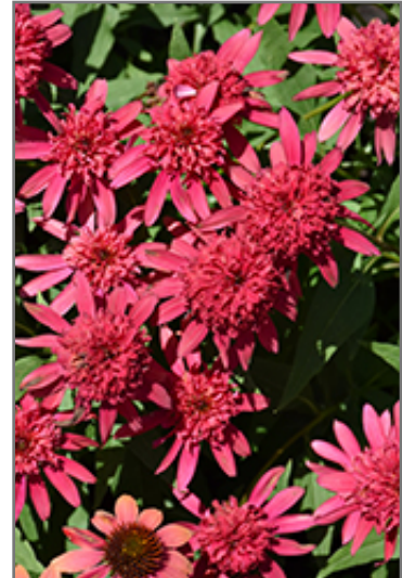
Double Scoop Raspberry Coneflower flowers

Double Scoop Raspberry Coneflower is recommended for the following landscape applications;