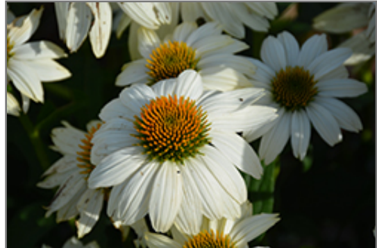
PowWow White Coneflower flowers

This is a relatively low maintenance plant, and is best cleaned up in early spring before it resumes active growth for the season. It is a good choice for attracting birds and butterflies to your yard, but is not particularly attractive to deer who tend to leave it alone in favor of tastier treats. It has no significant negative characteristics.