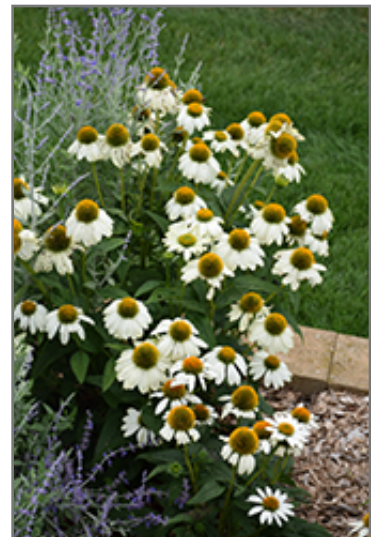
PowWow White Coneflower in bloom