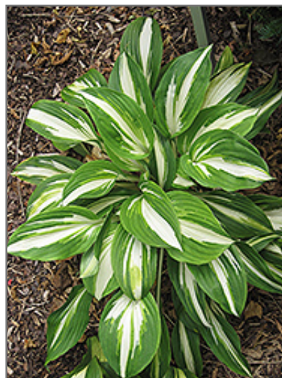
Enterprise Hosta

This is a relatively low maintenance plant, and is best cleaned up in early spring before it resumes active growth for the season. Gardeners should be aware of the following characteristic(s) that may warrant special consideration;