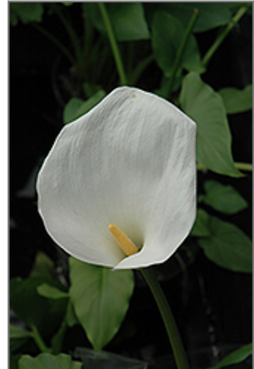
Calla Lily flowers

Calla Lily is recommended for the following landscape applications;