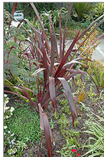
Amazing Red New Zealand Flax foliage