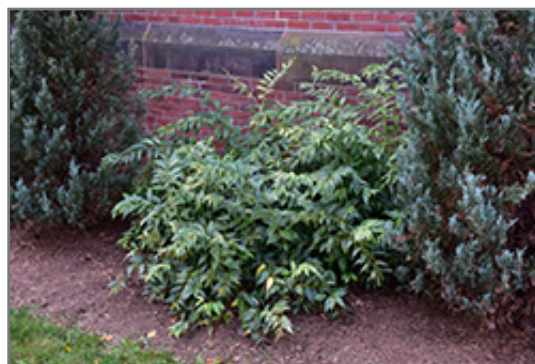
Rainbow Fetterbush