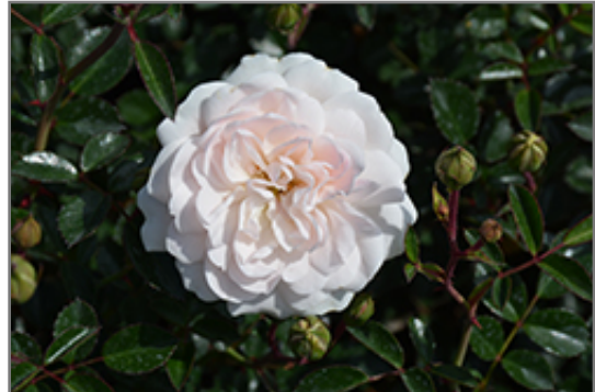
Sea Foam Rose flowers

This shrub will require occasional maintenance and upkeep, and is best pruned in late winter once the threat of extreme cold has passed. It is a good choice for attracting bees to your yard. Gardeners should be aware of the following characteristic(s) that may warrant special consideration;