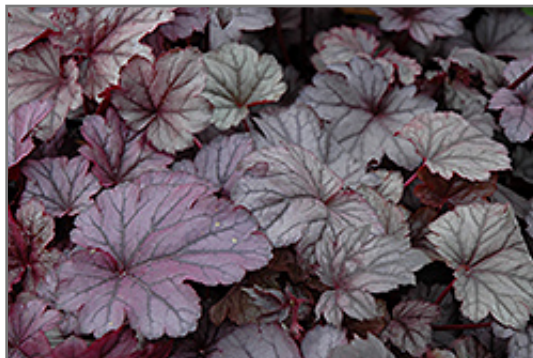
Shanghai Coral Bells foliage

Shanghai Coral Bells is recommended for the following landscape applications;