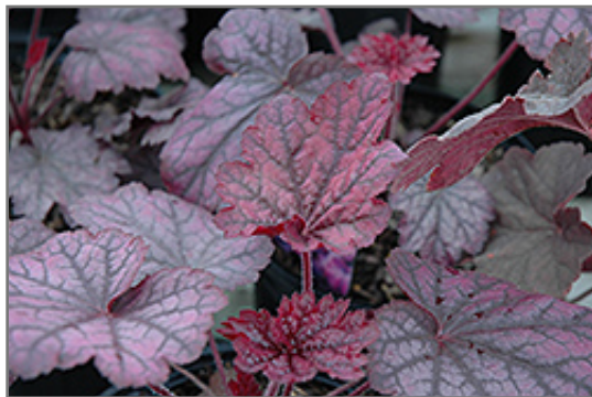
Midnight Bayou Coral Bells foliage

Midnight Bayou Coral Bells is recommended for the following landscape applications;