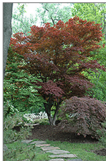
Oshio Beni Japanese Maple