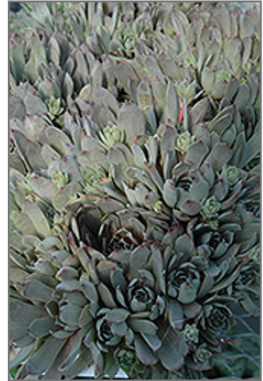
Big Blue Hens And Chicks