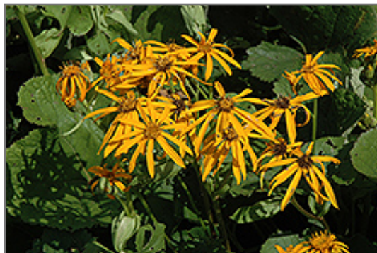
Othello Rayflower flowers