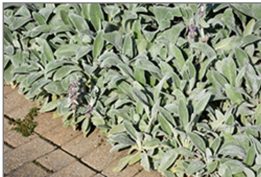
Lamb's Ears

* This is a 'special order' plant - contact store for details