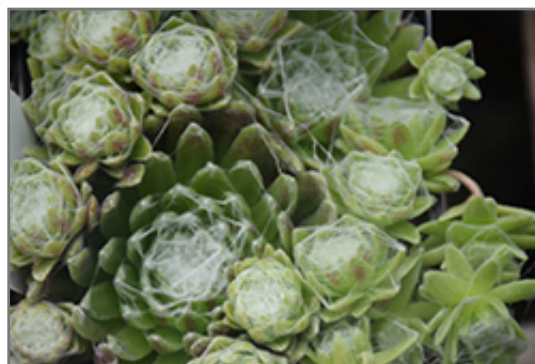
Cobweb Buttons Hens And Chicks