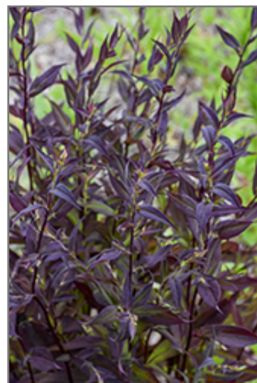
Lady In Black Calico Aster