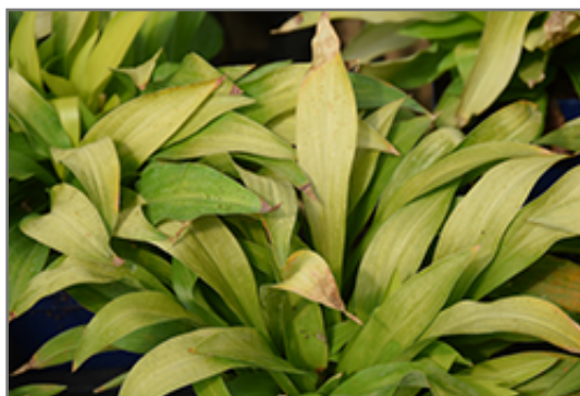
Munchkin Fire Hosta foliage