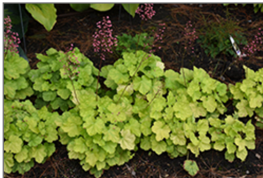
Primo Pretty Pistachio Coral Bells

Primo Pretty Pistachio Coral Bells will grow to be about 10 inches tall at maturity extending to 22 inches tall with the flowers, with a spread of 28 inches. When grown in masses or used as a bedding plant, individual plants should be spaced approximately 26 inches apart. Its foliage tends to remain low and dense right to the ground. It grows at a medium rate, and under ideal conditions can be expected to live for approximately 10 years. As an evergreen perennial, this plant will typically keep its form and foliage year-round.