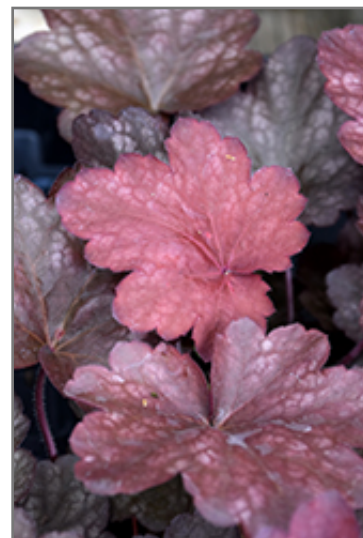
Carnival Candy Apple Coral Bells foliage