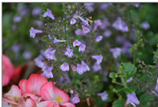
Marvelette Blue Dwarf Calamint flowers