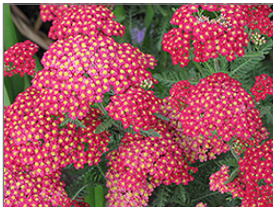
Galaxy Paprika Yarrow flowers