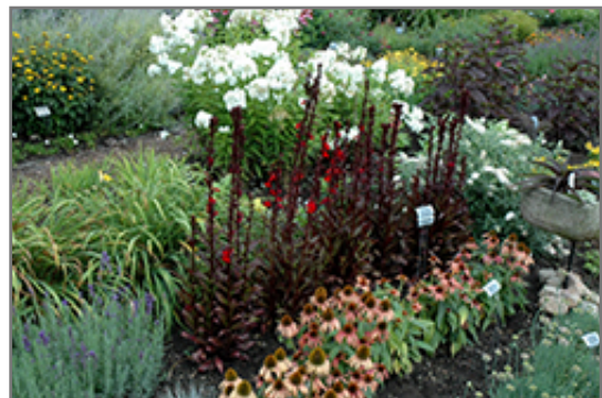
Vulcan Red Lobelia in bloom