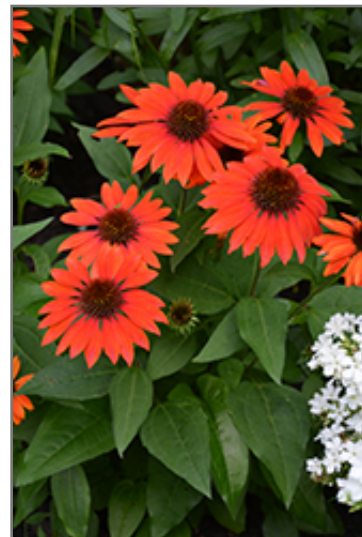
Sombrero Flamenco Orange Coneflower in bloom

Sombrero Flamenco Orange Coneflower is recommended for the following landscape applications;