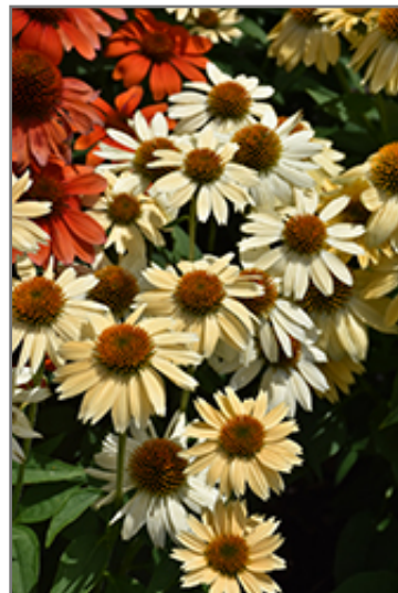
Sombrero Sandy Yellow Coneflower flowers

Sombrero Sandy Yellow Coneflower is recommended for the following landscape applications;