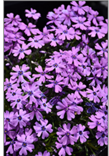
Purple Beauty Moss Phlox flowers