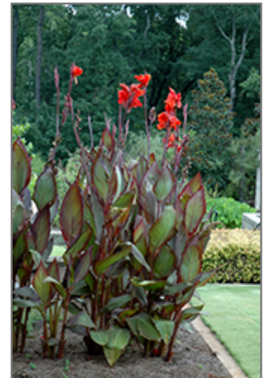
Australia Canna in bloom