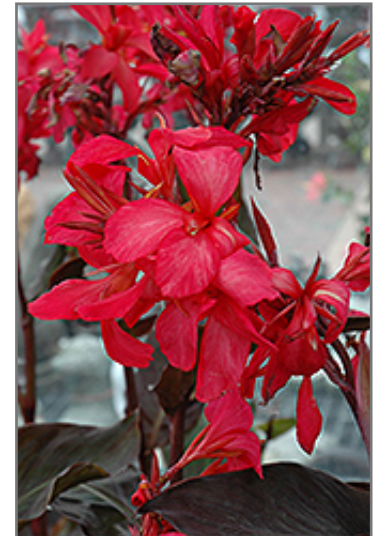
Australia Canna flowers

This plant should only be grown in full sunlight. It requires an evenly moist well-drained soil for optimal growth, but will die in standing water. It is not particular as to soil pH, but grows best in rich soils. It is highly tolerant of urban pollution and will even thrive in inner city environments, and will benefit from being planted in a relatively sheltered location. Consider applying a thick mulch around the root zone in winter to protect it in exposed locations or colder microclimates. This particular variety is an interspecific hybrid. It can be propagated by division; however, as a cultivated variety, be aware that it may be subject to certain restrictions or prohibitions on propagation.