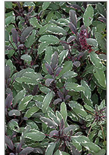
Tricolor Sage foliage