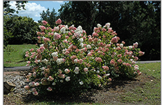
Vanilla Strawberry Hydrangea in bloom