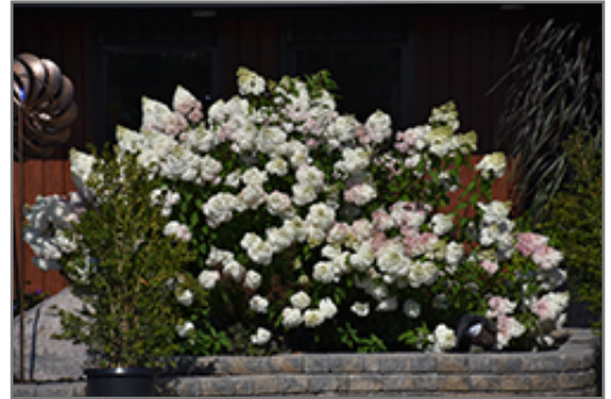
Vanilla Strawberry Hydrangea in bloom

This shrub performs well in both full sun and full shade. It prefers to grow in average to moist conditions, and shouldn't be allowed to dry out. It is not particular as to soil type or pH. It is highly tolerant of urban pollution and will even thrive in inner city environments. Consider applying a thick mulch around the root zone in winter to protect it in exposed locations or colder microclimates. This is a selected variety of a species not originally from North America.