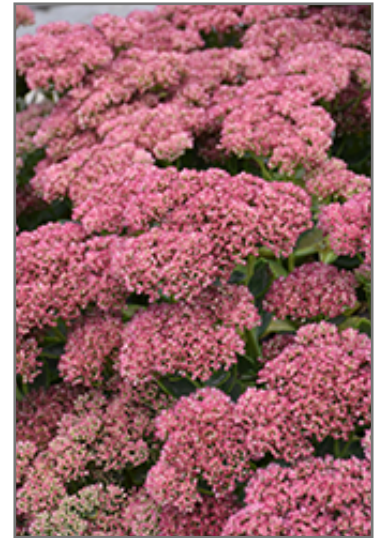
Autumn Fire Stonecrop flowers

Autumn Fire Stonecrop is a dense herbaceous perennial with an upright spreading habit of growth. Its relatively coarse texture can be used to stand it apart from other garden plants with finer foliage.