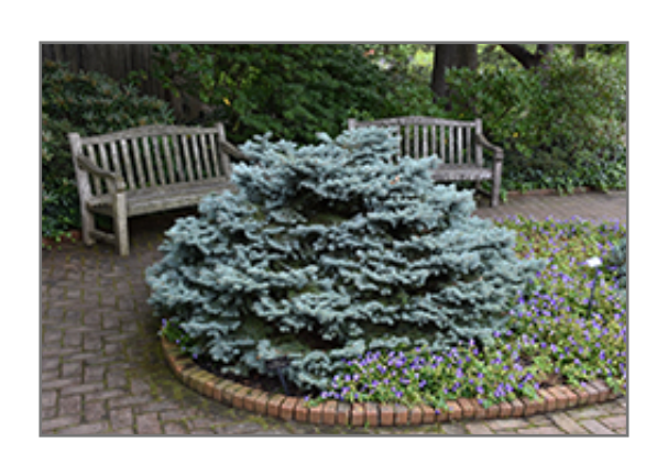
Thume Blue Spruce

A highly desirable and popular dwarf blue spruce that grows very dense while retaining its distinctively conical shape; needles emerge a beautiful silver and retain a powdery-blue color throughout the season, an ideal choice for the garden designer