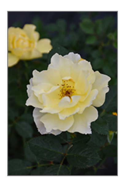
Yukon Sun Rose flowers

Yukon Sun Rose is recommended for the following landscape applications;