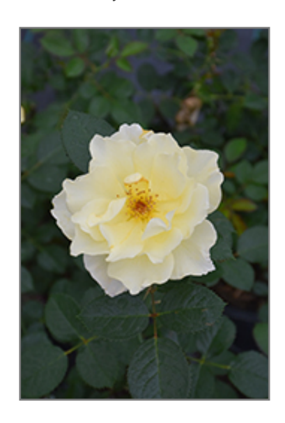
Yukon Sun Rose flowers