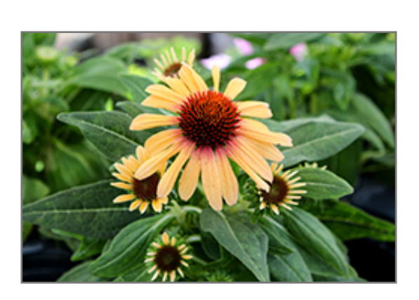
SunSeekers Tequila Sunrise Coneflower flowers

An outstanding series with eye catching color; strong and bushy habit that is ideal for sunny borders and mixed containers; large, golden yellow flowers have bright red bullseyes around copper cones; deadhead spent blooms