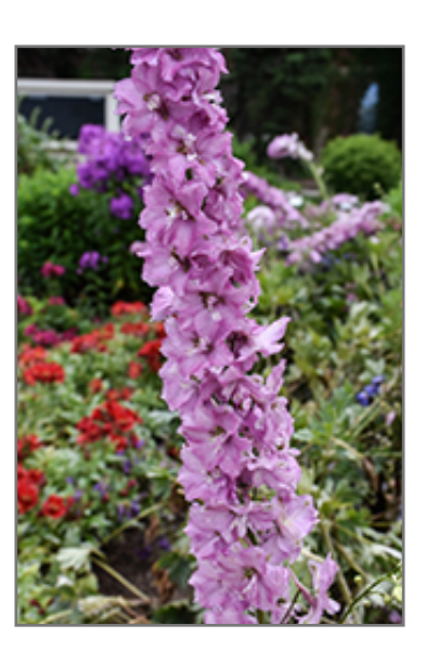
Delgenius Chantay Larkspur flowers

Tall sturdy stems of beautiful, double rose pink flowers emerge from bushy mounds of dark green foliage; blooming from early to late summer, an excellent addition to borders, beds and patio containers; stunning cut flower; remove spent flower spikes