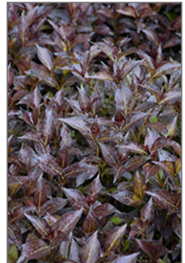
Midnight Wine Shine Weigela foliage