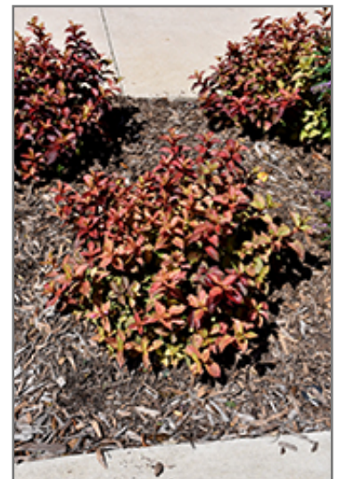
Midnight Sun Reblooming Weigela