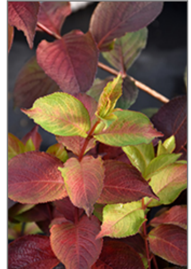
Midnight Sun Reblooming Weigela foliage