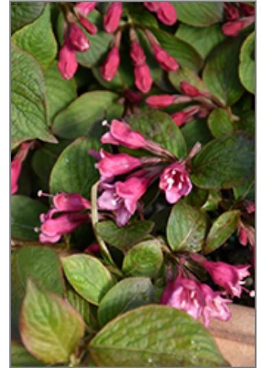
Midnight Sun Reblooming Weigela flowers

Midnight Sun Reblooming Weigela makes a fine choice for the outdoor landscape, but it is also well-suited for use in outdoor pots and containers. It is often used as a 'filler' in the 'spiller-thriller-filler' container combination, providing a mass of flowers and foliage against which the thriller plants stand out. Note that when grown in a container, it may not perform exactly as indicated on the tag - this is to be expected. Also note that when growing plants in outdoor containers and baskets, they may require more frequent waterings than they would in the yard or garden. Be aware that in our climate, most plants cannot be expected to survive the winter if left in containers outdoors, and this plant is no exception. Contact our experts for more information on how to protect it over the winter months.