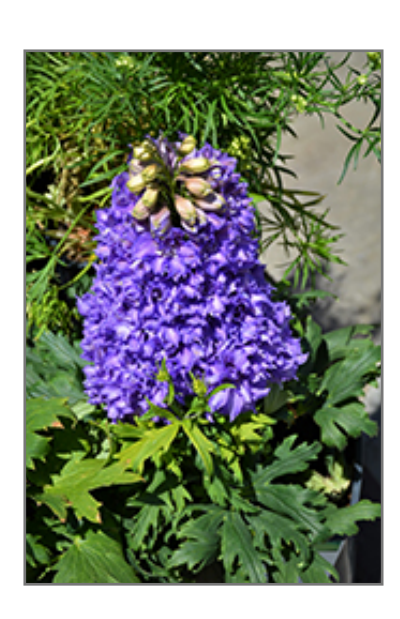
Delgenius Breezin Larkspur flowers

Tall sturdy stems of beautiful double purple flowers emerge from bushy mounds of dark green foliage; blooming from early to late summer, an excellent addition to borders, beds and patio containers; stunning cut flower; remove spent flower spikes