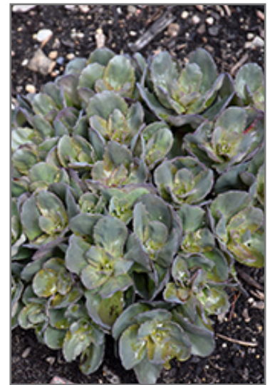
Rock 'N Grow Back in Black Stonecrop foliage