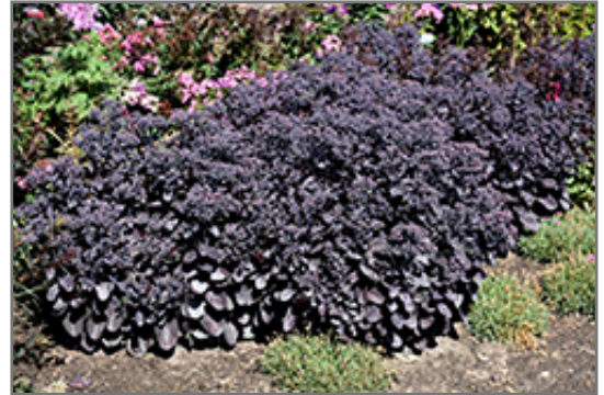
Rock 'N Grow Back in Black Stonecrop in bloom

Rock 'N Grow Back in Black Stonecrop has masses of beautiful clusters of creamy white star-shaped flowers with cherry red eyes at the ends of the stems from late summer to early fall, which emerge from distinctive crimson flower buds, and which are most effective when planted in groupings. The flowers are excellent for cutting. Its attractive large succulent round leaves emerge burgundy in spring, turning black in colour with showy dark gray variegation and tinges of coppery-bronze throughout the season. The deep purple stems are very colorful and add to the overall interest of the plant.